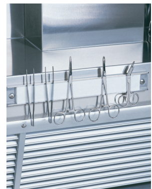
Magnetic tool holder