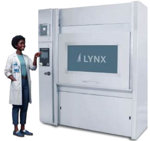
12 configurable cycles

Customizable, hydro-spray washers designed for ease of use, minimal maintenance, and high throughput.