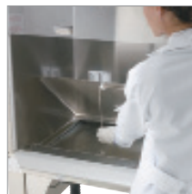
Prop Up Work Surface