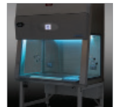
Ultraviolet (UV) Light