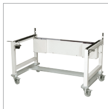
Motorized Base Stand