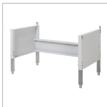
Telescoping Leg Leveler or Castor Base Stand