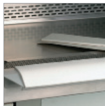
Arm Rest Pads