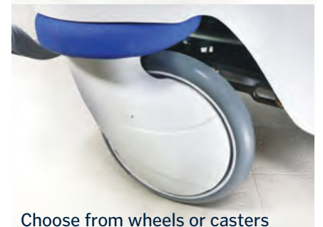
Choose from wheels or casters