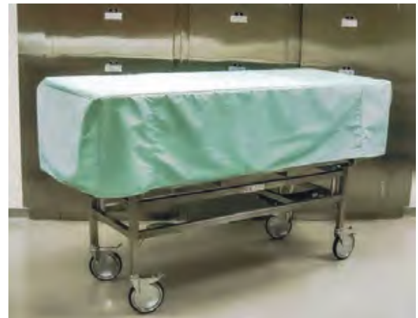
Optional concealment cover