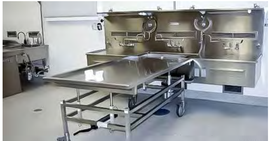
The AR511 Series Transport Cart attached to the CSI Jewett Brand SR1910 Series Wall-Mounted Dissecting Sink.

WEBSITE link Hydraulic Lift Transport Carts