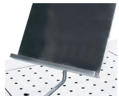
Book holder (Optional)