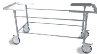
SR2079-06 | Stainless Steel with and without tray