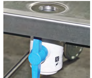
Drain with valve (Optional)