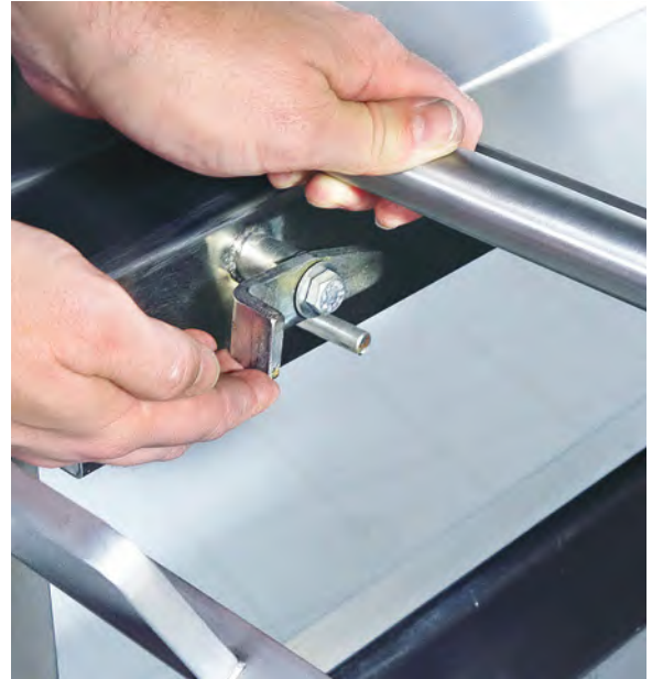
Automatic pivoting tray lock system secures the tray in place