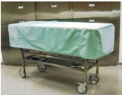
Removable concealment cover (Optional)