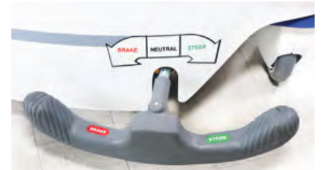
Brake and steering