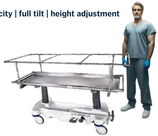
Tray with rack for concealment cover.

700lbs. capacity | full tilt | height adjustment