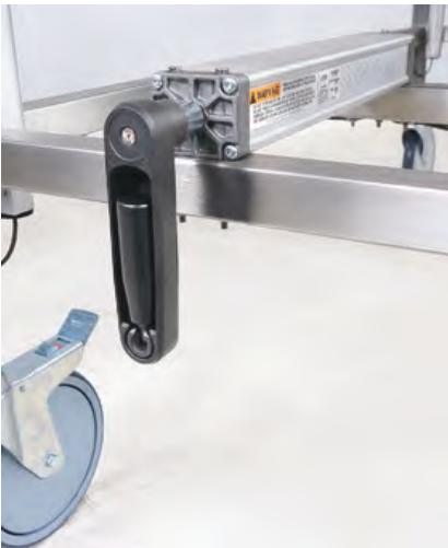
Hydraulic elevating tilt mechanism (Optional)