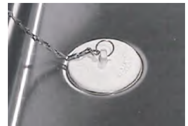
Drain with plug (Optional)