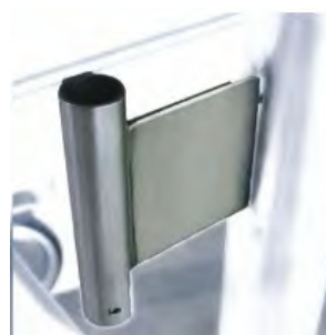
Accessory mount (Optional)