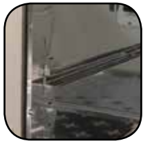
Adjustable, No Tip Shelf Design