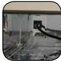
Interior Electrical Outlet