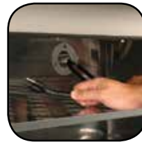
Throughwall Access Port