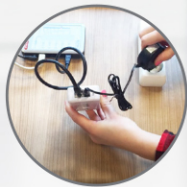
Plug in power cord