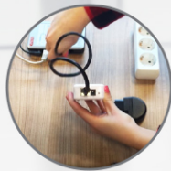
Plug in Ethernet cable