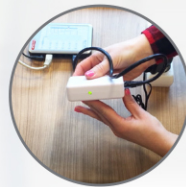
AccessPoint is ready!